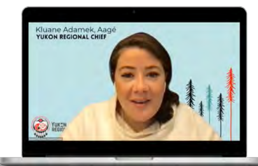
[ CLICK HERE TO ACCESS RECORDING ]