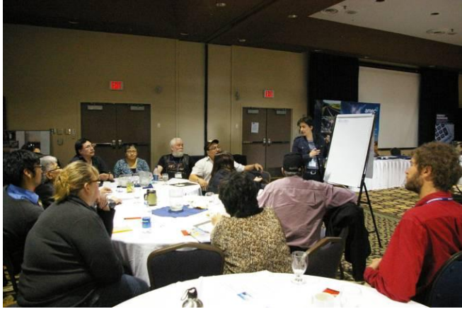
Photo above: The Beaufort –Delta region participants engage in regional action planning on the last day of the forum.