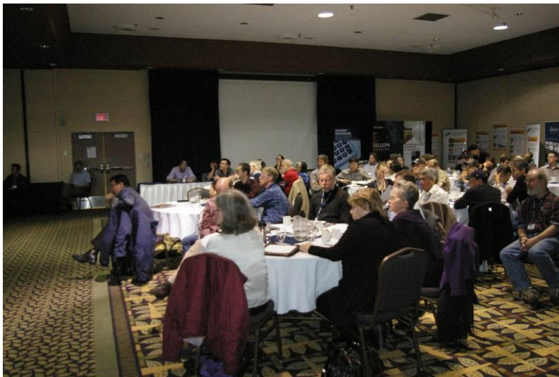
Photo above: Twenty-seven out of the 33 communities in the NWT were represented at the forum.