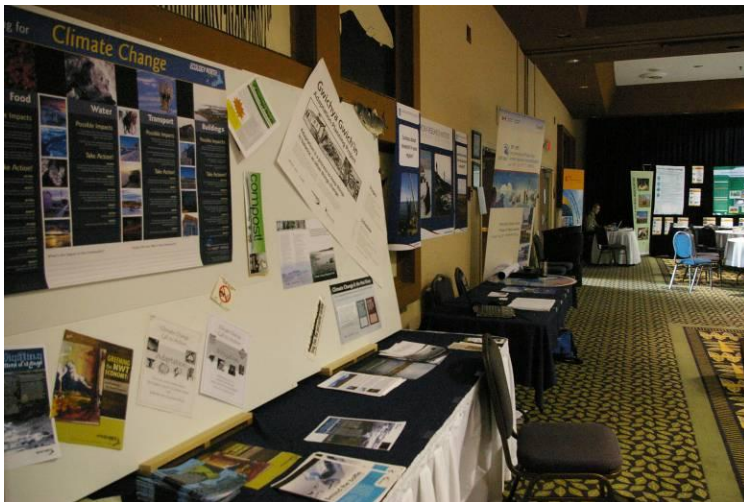
Photo above: Organizations, governments and consulting agencies set up resource booths around the perimeter of the main plenary room to share information about their work on climate change issues.

With participants standing in a circle around the plenary room, Besha Blondin gave a closing prayer and song.