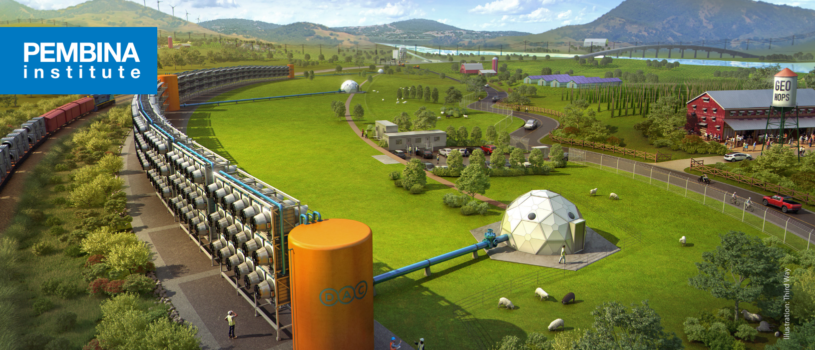
Illustration: Third Way