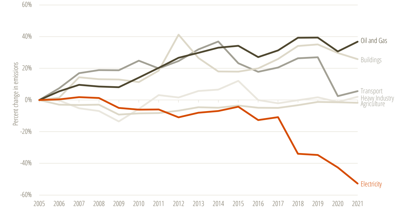
Figure 2. Percent change in emissions by economic sector, Alberta

Figure 2 shows that, with the exception of the electricity sector, emissions across all sectors of Alberta's economy had increased, remained flat, or seen a nominal decrease (-1.5% in the agriculture sector) in 2021 compared with 2005. The progress made in the electricity sector is largely due to the phase-out of coal-fired power stations, which will be complete in 2024, combined with a growing renewable electricity industry. This demonstrates the progress that can be made when a sectoral pathway to emissions reduction is defined (elimination of coal-fired electricity generation), transition plans are made (for the labour force, alternative generation capacity), and enabling policies (TIER large-emitter trading system, federal coal-fired power emissions regulation, provincial agreements with generators) and other programs (e.g., the Renewable Electricity Program)<sup>8</sup> are put into action, giving industry appropriate signals and milestone dates to work towards in their investment plans.